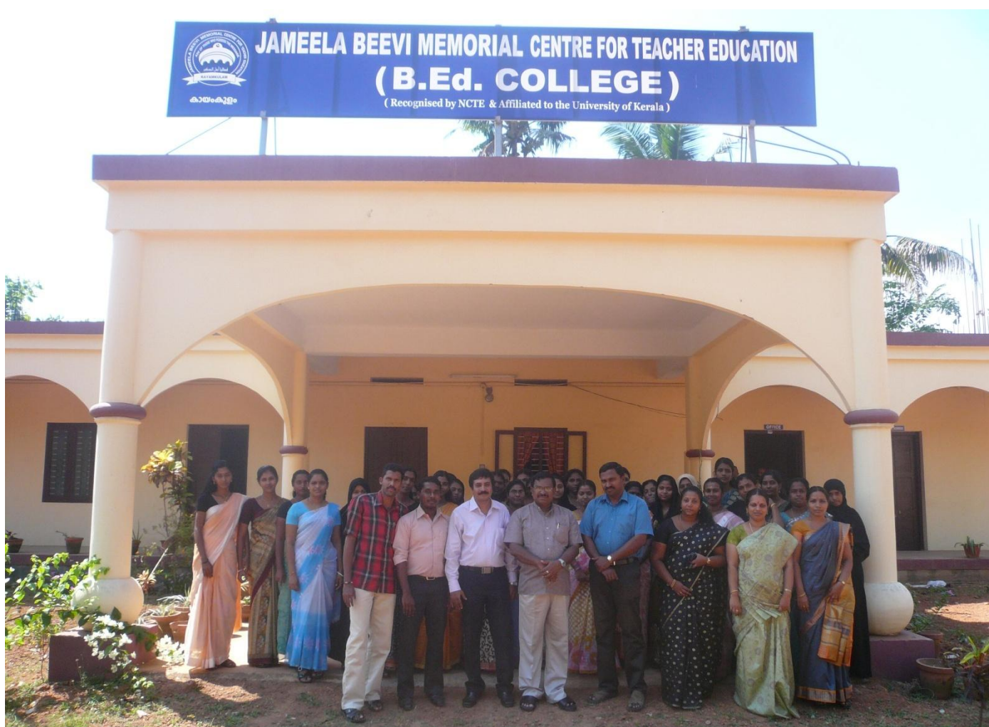
Participants with Facilitator & Guest