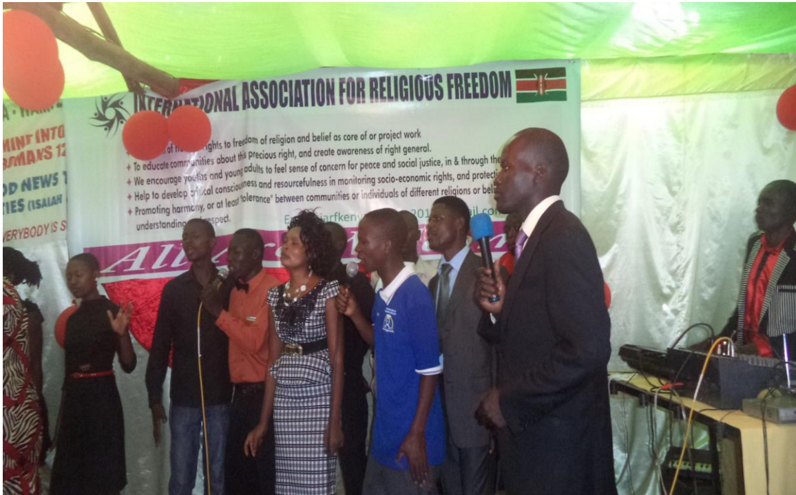
Group of choirs