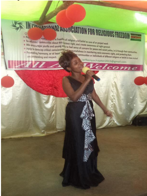
Merembe-Artist from Uganda