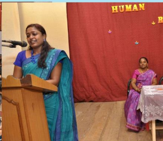
Human Rights Day Celebration at Tuticorin, Tamilnadu