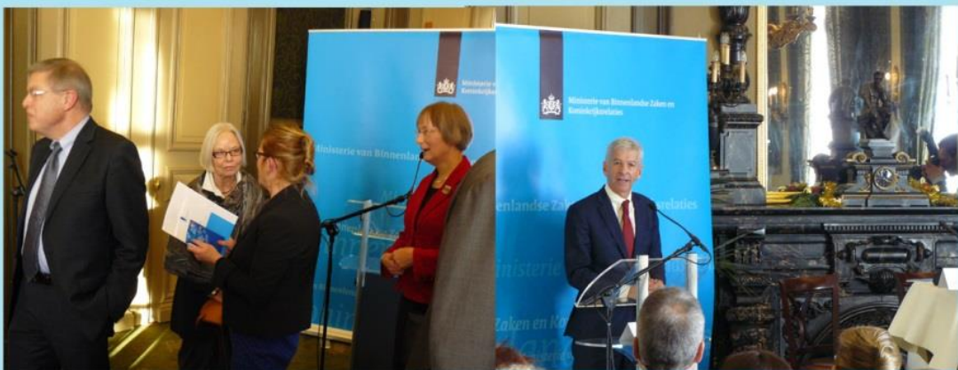
International Human Rights Day Celebration at Netherlands by IARF Dutch Chapter