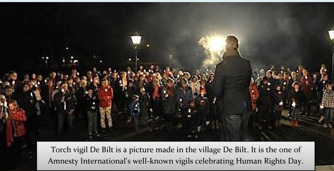
Torch vigil De Bilt is a picture made in the village De Bilt. It is the one of Amnesty International's well-known vigils celebrating Human Rights Day.

IARF Dutch Chapter (NLG) is one of the NGOs asked to provide input for the first draft of the government report that was eventually presented to the U.N. Human Rights Council during the UPR. At a later stage it also contributed to the plan of action which was one of its chief outcomes. In its recommendation, it has submitted its preferred priorities and has put forward suggestions for further action. IARF NLG is looking forward to continuing its involvement by participating in a monitoring process, the first meeting of which is coming up shortly, at which the new plan of action will be assessed.