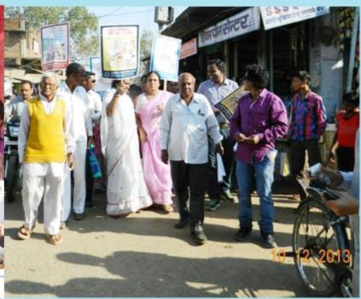
International Human Rights Day Celebration and Peace Walk at Chhindwara, M.P