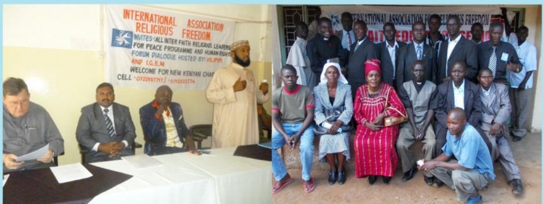
“Introductory Chapter event to introduce HRE in the town of Kitale in western Kenya” and the Group Photo in the South Nyanza Province.