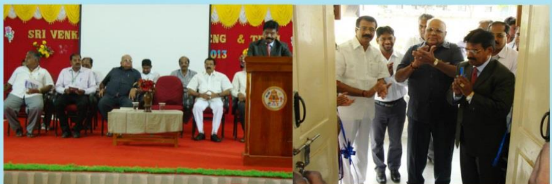
Launching New HRRC Branch at Chennai, India