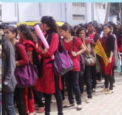
Peace Walk at Bangalore