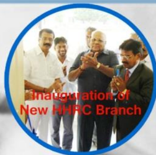
Inauguration of New HHRC Branch

We are all Born FREE & EQUAL (UDHR Art 1)