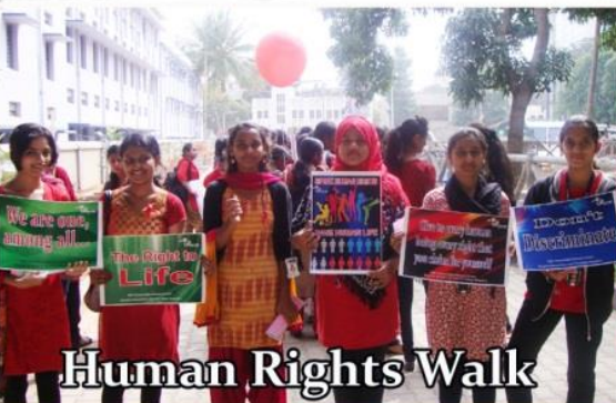
Human Rights Walk

We are all Born FREE & EQUAL (UDHR Art 1)