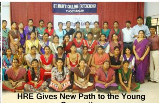
HRE Gives New Path to the Young Generation

Human Rights Education Together for Peace