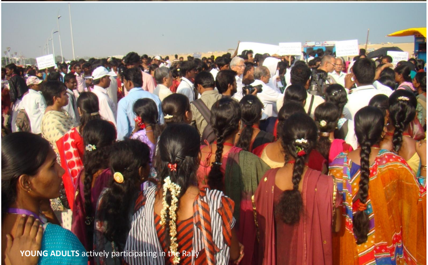
YOUNG ADULTS actively participating in the Rally