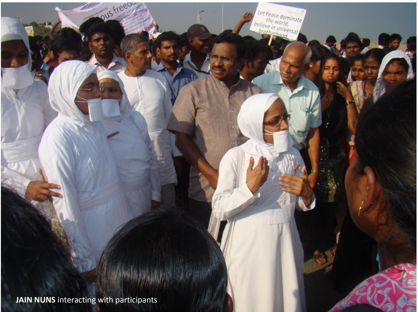
JAIN NUNS interacting with participants