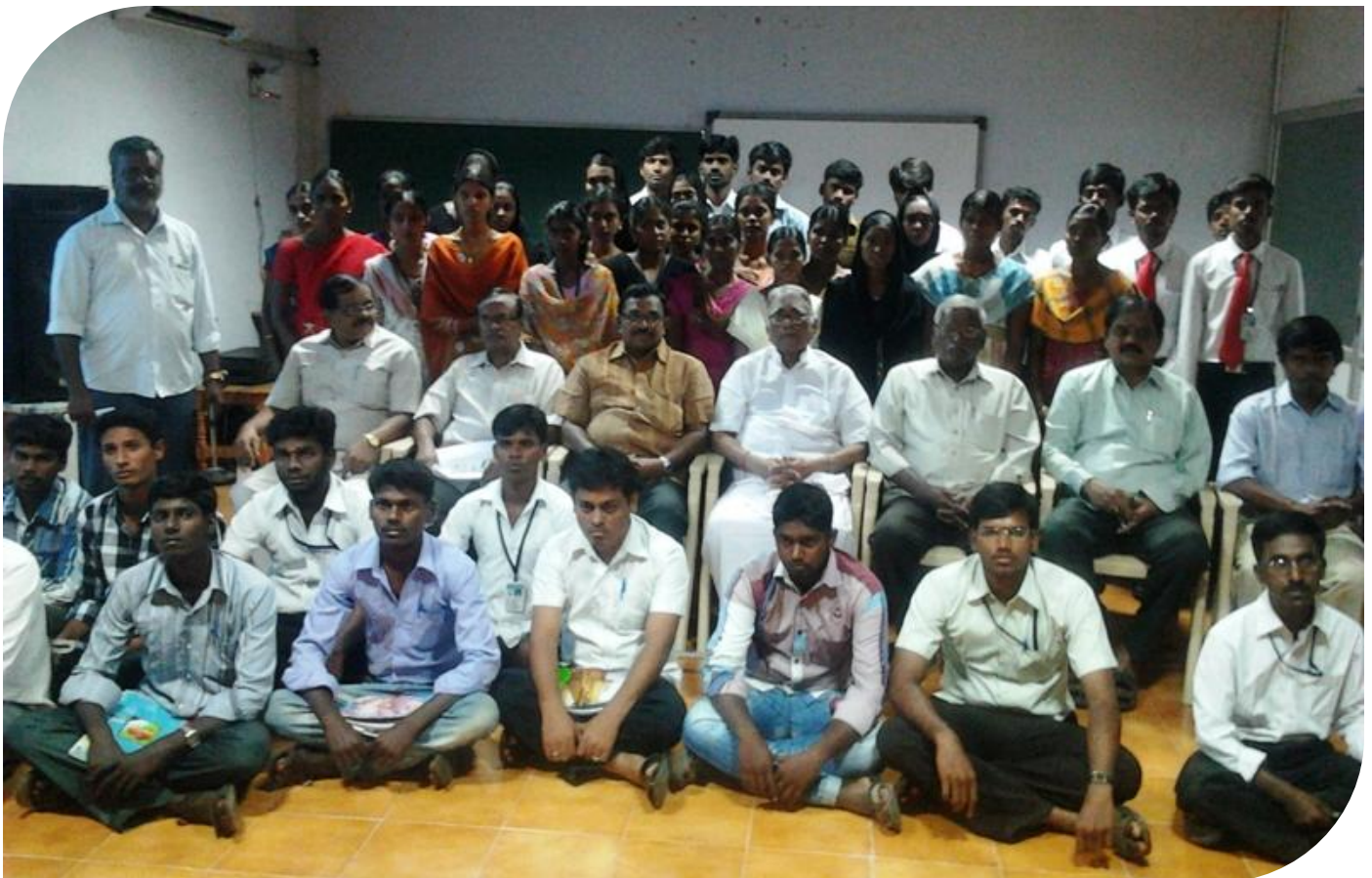
Participants with Facilitator, College Officials and Guests