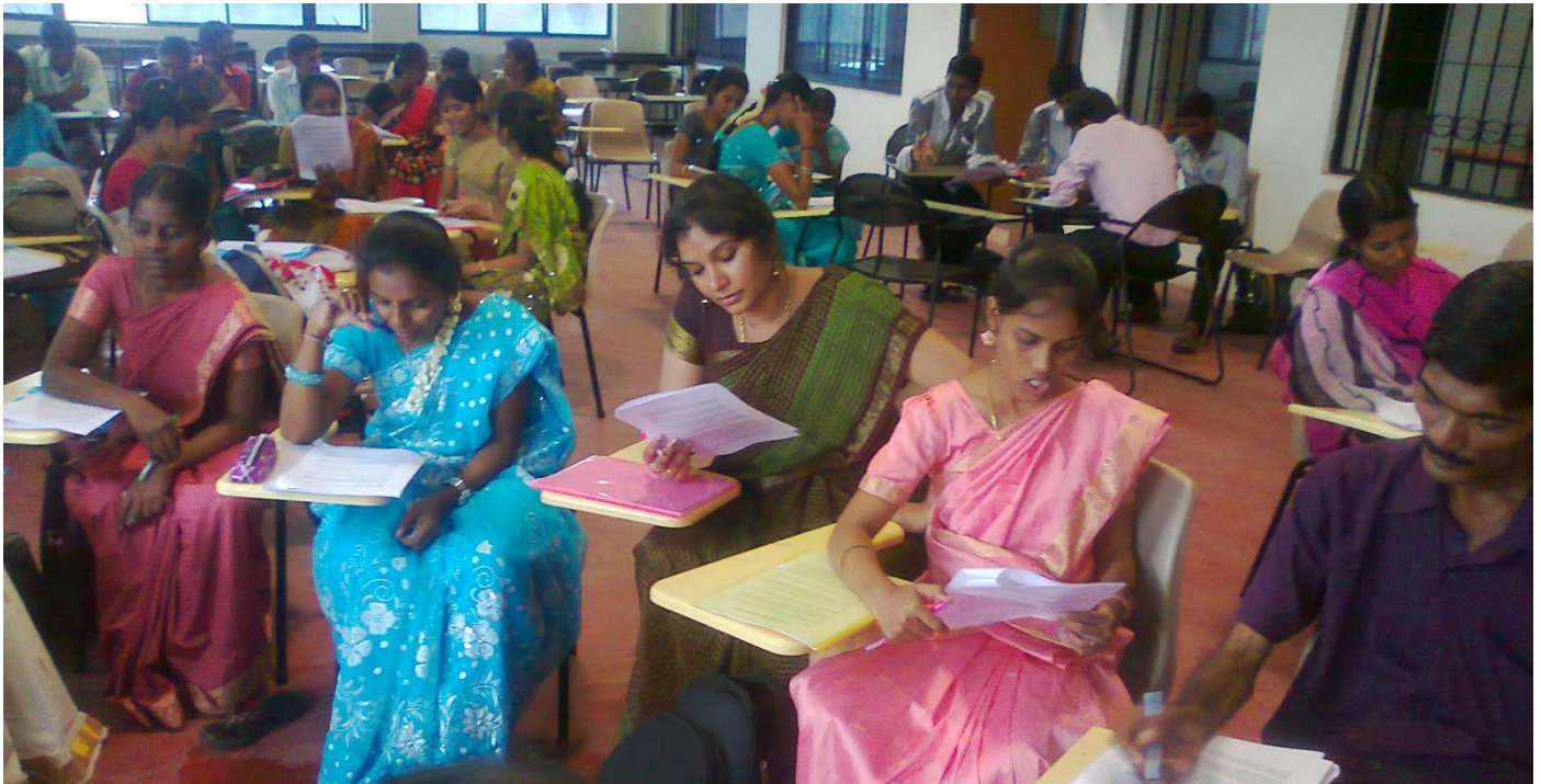
GROUP ACTIVITIES in progress

We hope that the participants will keep up their assurance and do the needful to the community.