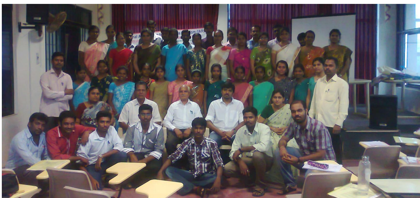
PARTICIPANTS with Facilitator and College Officials