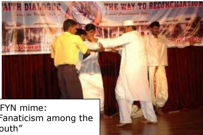
RFYN mime: "Fanaticism among the youth"

The Valedictory function commenced at 4 pm & concluded at 6 pm, in the presence of the following dignitaries: