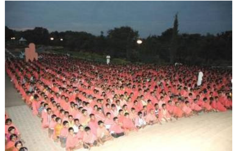
Orphans of Suttur Math joined for prayer