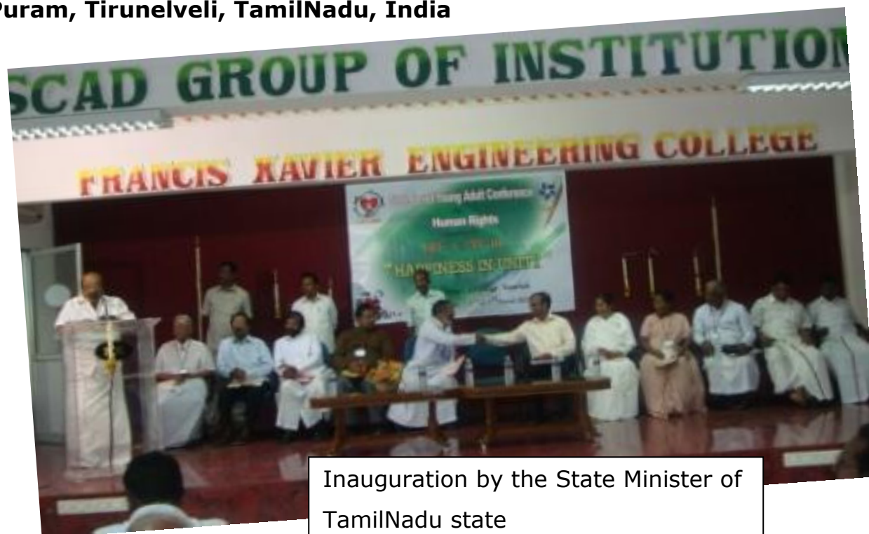
Inauguration by the State Minister of TamilNadu state