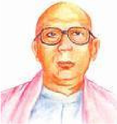
Swami Jitatmananda-ji Maharaj

http://www.iarf.net/2008site/Congress/2010/index2010.htm