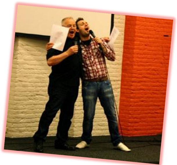
"Irish eyes are smiling"

To create an atmosphere in which participants from different backgrounds could feel comfortable to share their experiences, several less formal programme items had been scheduled. If exchanging email addresses is the lowest